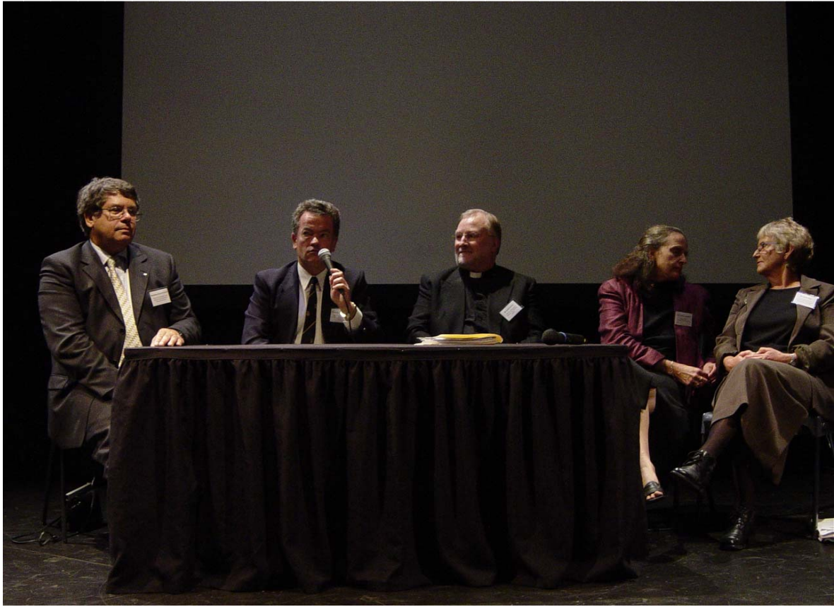
After the five speakers had finished, a panel discussion was held.